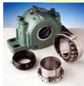
Timken Torrington SAF pillow blocks combine rugged cast-iron housings with high capacity spherical roller bearings.