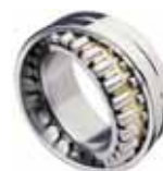
Timken has a complete range of Torrington small bore spherical roller bearings for many operations within the paper mill.